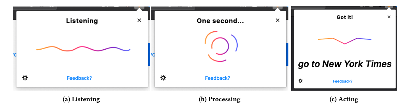
Figure 2: Firefox Voice's command sequence includes three phases: Listening, Processing, and Acting.

In this research, we revisit the frontier of voice-assisted web browsers. We report findings from a preliminary think-aloud study (n=5) aimed at understanding the challenges, opportunities, and future directions of utilizing a voice assistant in modern web browsers. We drive our inquiry with Firefox Voice , a browser extension that implements a voice assistant inside the Firefox desktop web browser. The purpose of this study was to not only better understand how the tool enables new opportunities fueled by voice, but also how it complements existing practices of non-verbal interactions. We seek to use our observations from this preliminary study to provoke new conversations and questions around voice interactions that take place within the browser and around it.